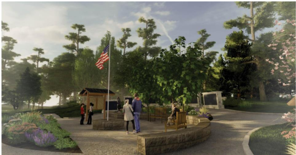
Conceptual rendering of the proposed plaza.

In June, the Courtland Street Reinterment Committee held a Hallowing of the Grounds ceremony at the site chosen for the Repose of the Fallen structure. A team of archaeologists conducted a research dig this summer and determined that building on the selected site would have no adverse archeological or other negative impact on the park. The committee is currently working with the designer to create final plans with fine details including species of plants for landscaping and type of pea gravel to be used.