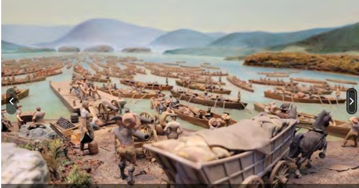
The new diorama of the 1758 flotilla led to Ticonderoga by General James Abercromby in Lake George, N.Y.