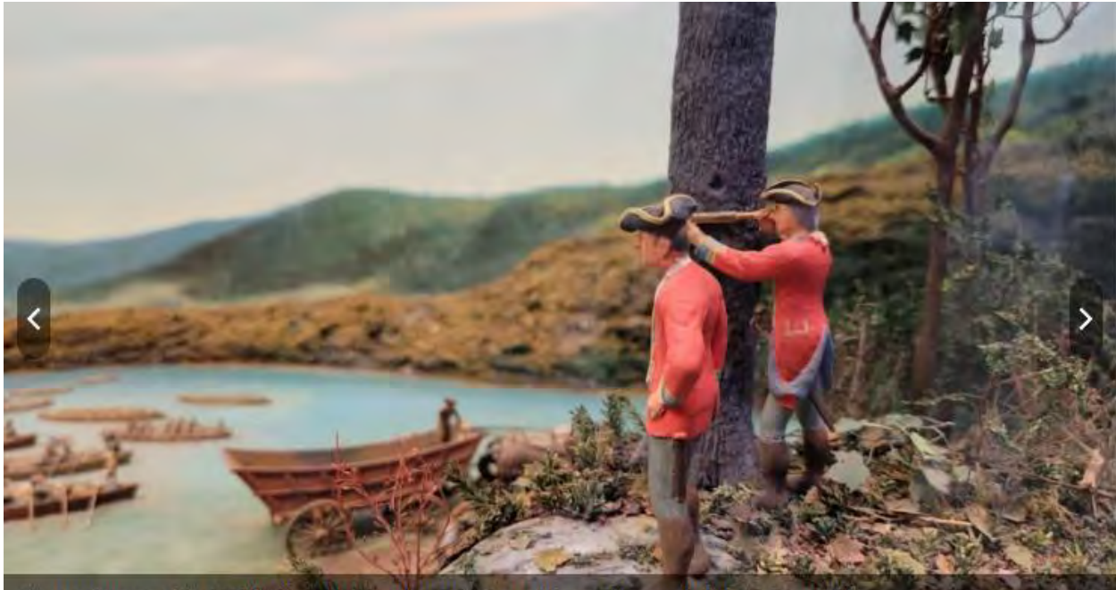
The new diorama of the 1758 flotilla led to Ticonderoga by General James Abercromby in Lake George, N.Y.