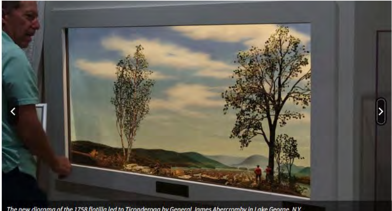
The new diorama of the 1758 flotilla led to Ticonderoga by General James Abercromby in Lake George, N.Y.