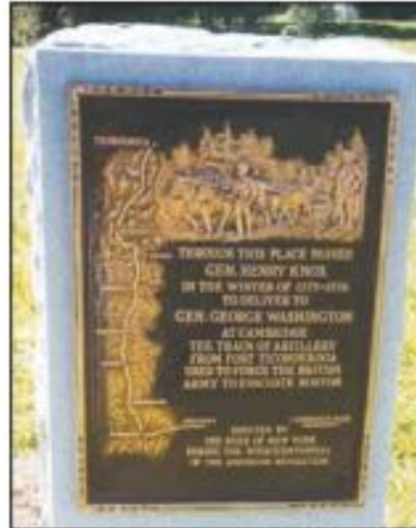
Monuments are erected along the Knox cannons route. One is at the north end of Crandall Park close to Glen Street.

"Washington used the newly gained equipment to cow British Commander William Howe into evacuating his