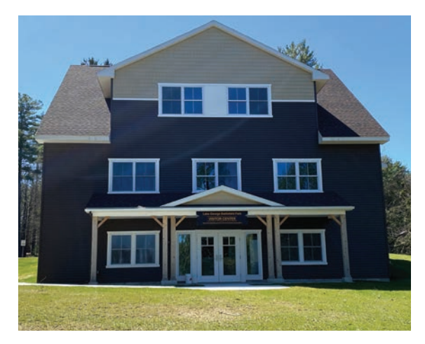
Battlefield Park Visitor Center

The Lake George Battlefield Park Alliance supports activities that help preserve the unique history of this landmark park operated by the State of New York. Exhibits in our new Visitor Center include narratives explaining the history of the Park that spans the habitation of indigenous peoples through two 18<sup>th</sup> century wars and beyond. Displays also include artifacts from archaeological digs in the Park, models of the two forts that had been built on the grounds, preserved fragments from the 1756 sloop Earl of Loudoun, and a gunport lid from the 1758 radeau Land Tortoise. Paintings and site plans further connect visitors to Park history.