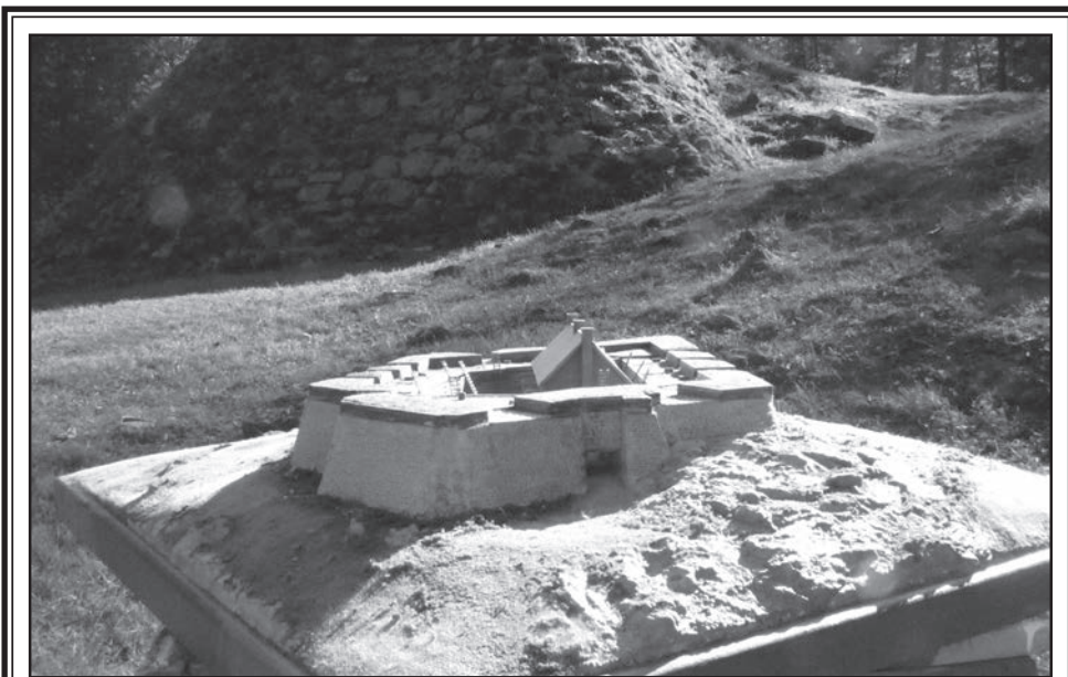
Picture of the model of Fort George by Rick Conley at the site of Fort George in the park. The model in this picture is not quite complete as it is missing the guard station at the entrance. The fort is complete at this time.