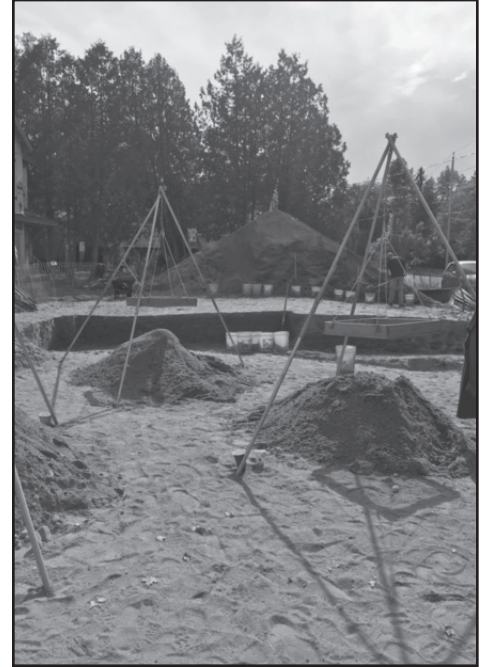
The pile of sand from the excavation was 25 meters long and 5 meters wide and initially started approximately where the most distance sifter is located.

When the cemetery was first identified, the Alliance petitioned the Town of Lake George and the Village of Lake George to ensure that these Patriots received a respectful reburial, unlike many remains that are stored in boxes in various museums. Our resolution was passed by both the Town and Village. The Courtland Street Reinternment Committee is currently working on plans for the reburial in May 2023. The location will be in LG Battlefield Park near the Unknown Soldiers. An appropriate repository is being developed as well as planning for a ceremony modeled on previous ceremonies of this type. We will keep you updated as planning progresses. ■