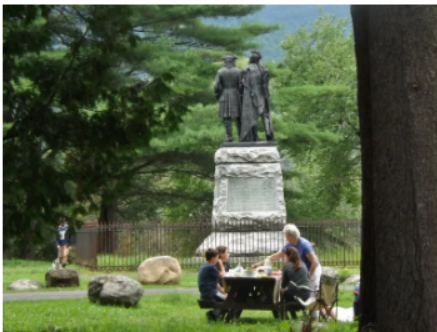
Visitors picnic on the historic grounds of Lake George Battlefield Park.