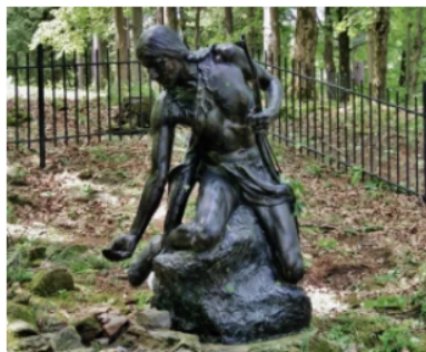
The Mohawk Warrior fountain was gifted to Lake George Battlefield Park in 1921.

Featured photo: Workers pour footings for the new Lake George Park Commission offices on Fort George Road, 07/30/2020.