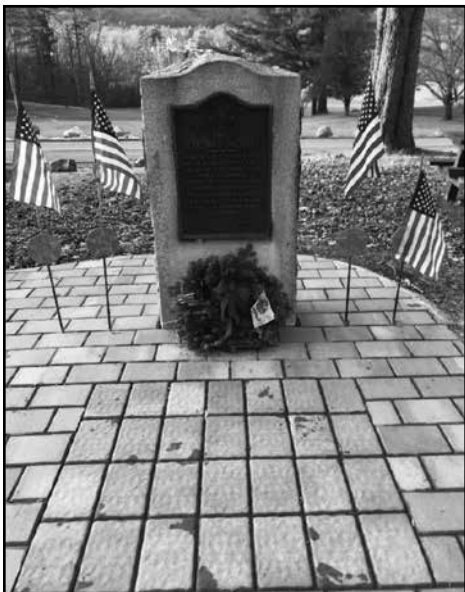
Four Unknown Soldiers of the Battle of Lake George remembered with a Wreath Across America wreath for the holidays.

Register to volunteer at: www.ptny.org/ilovemypark